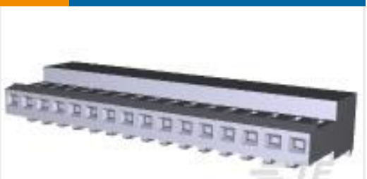
TE Part #4-641191-6 16P MTA100 CONN ASSY WHT LF