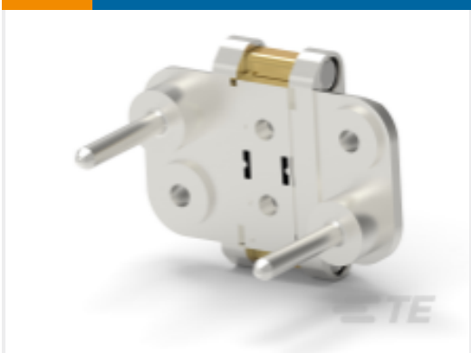
TE Part #1926854-1 CONNECTOR, PIN, DOMINO