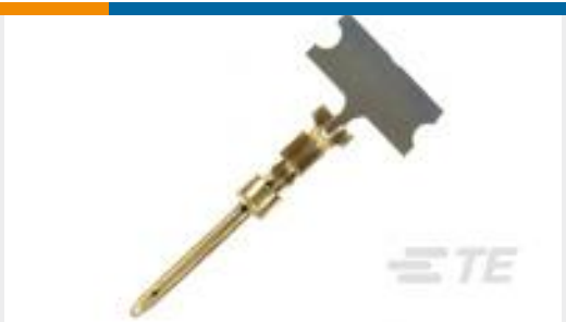
TE Part #66506-8 PIN CONTACT, 20 DF