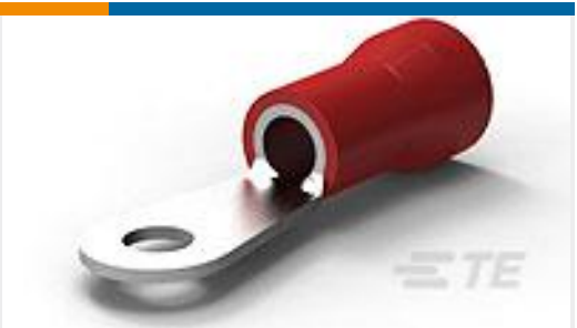
TE Part #52263 TERMINAL R PG 8 10