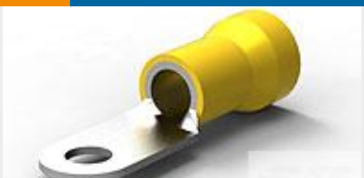
TE Part #52043-1 TERMINAL R PG 4 1/4