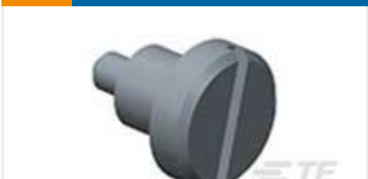
TE Part #1650106-1 902-84-02113=SCREW,SHOULDER,#6-32