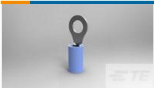
TE Part #53942-2 TERMINAL,PIDG R 16-14 10